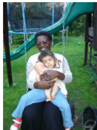
Charles University Prague.